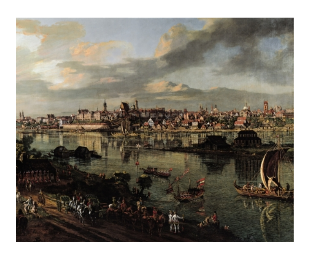
The Canaletto Room,

During the reign of Stanislaus Augustus this room was the most important antechamber in the King's Apartment. The interiors were designed by Domenico Merlini in 1776-77. Here the King decided to hang a series of views of Warsaw, painted by the renowned Venetian artist, Bernardo Bellotto, also known as Canaletto.